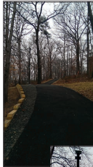
The reconstructed portion of Doctors Run Trail.